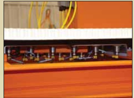
New Sensor Panels (on one-inch centers)