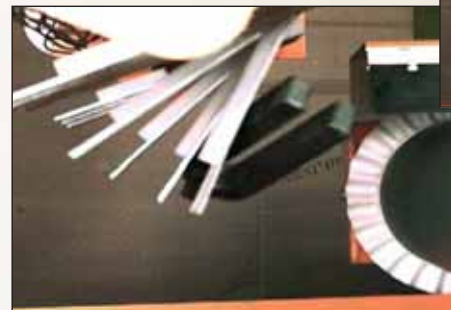
Powerful inverted paddles deflect heavy (8 lbs) metal objects into sorting stations