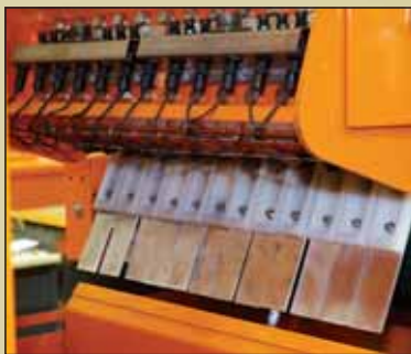
Sensor activated paddles