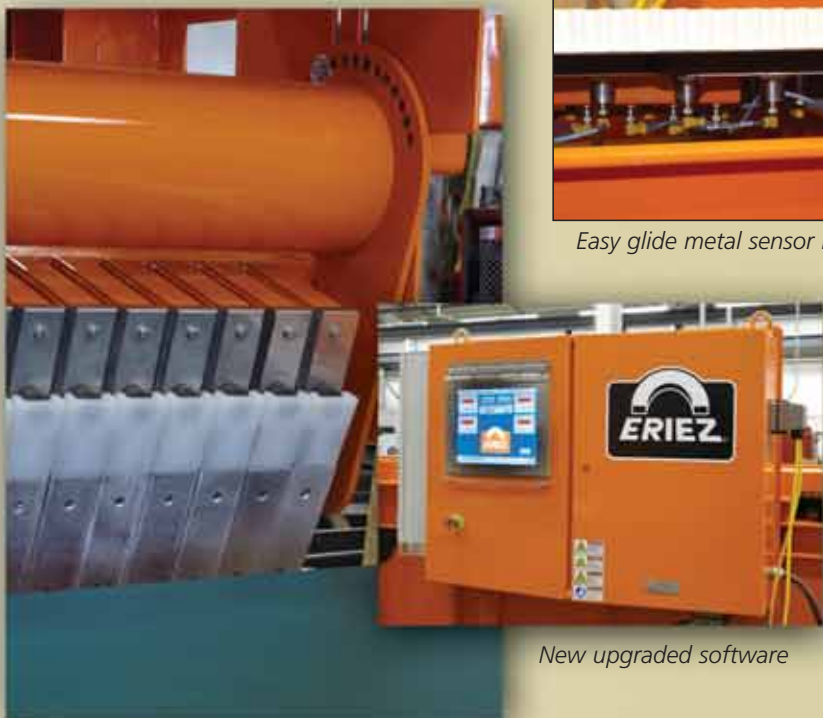
New upgraded software