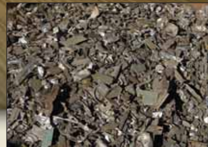
Cleaner metals... better recovery