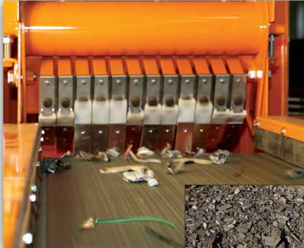
ProSort II improves detectability with double the number of sensors