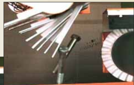
Improved sensors detect even individual wires