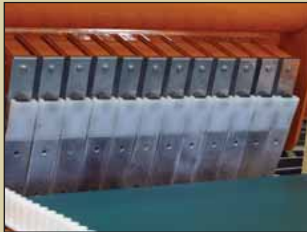
New Inverted Paddle Assemblies

Take advantage of ProSortII's improved recovery with Eriez' upgrade packages. Packages include new high resolution sensor panels (on one-inch centers), replacement of existing paddles with new inverted paddle assembly and support structure, software upgrades, installation and testing.